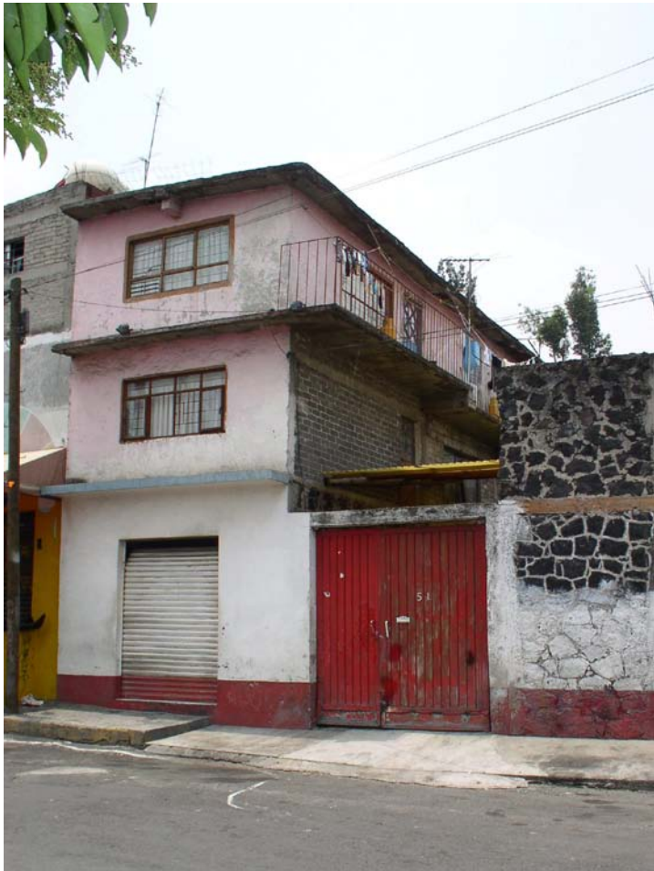
Figure 1c shows the same 3 story dwelling (from Figs. 1a & 1b) in close up. Figure 1d shows how lots may be divided (between 2 kin related families [note double electricity meters on the left hand home]); while part of next door's lot has been sold off as a separate dwelling (garage door & entrance with rooms above).